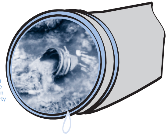
Overflowing cleanout pipe located on private property

Always notify your city sewer/public works department or public sewer district of sewage spills. If the spill enters the storm drains also notify the Health Care Agency. In addition, if it exceeds 1,000 gallons notify the Office of Emergency Services. Refer to the numbers listed in this brochure.